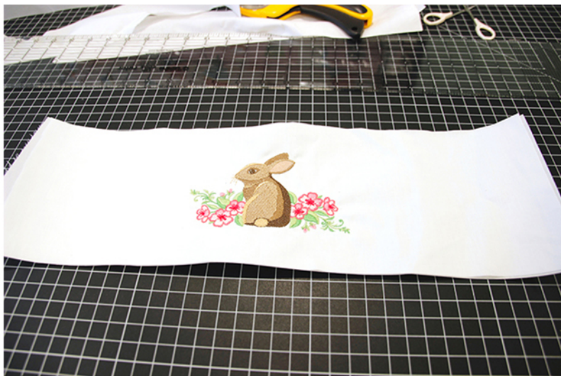
15. It should look something like this after being cut.