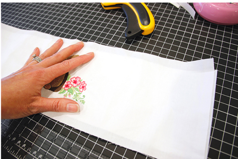
18. In this photo, you can see through the white fabric to reveal that the stabilizer has been properly trimmed.