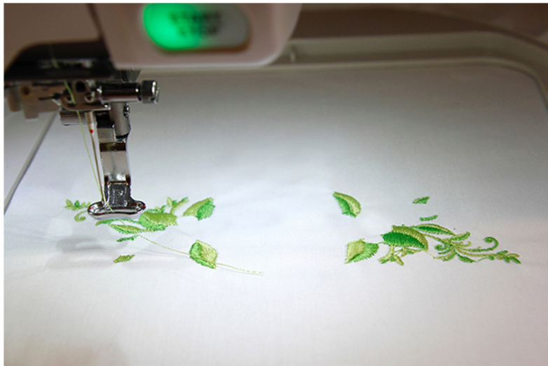
2. Thread the lighter green and finish the leaves.