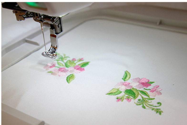
5. Now for a sweet medium pink for the remaining petals.