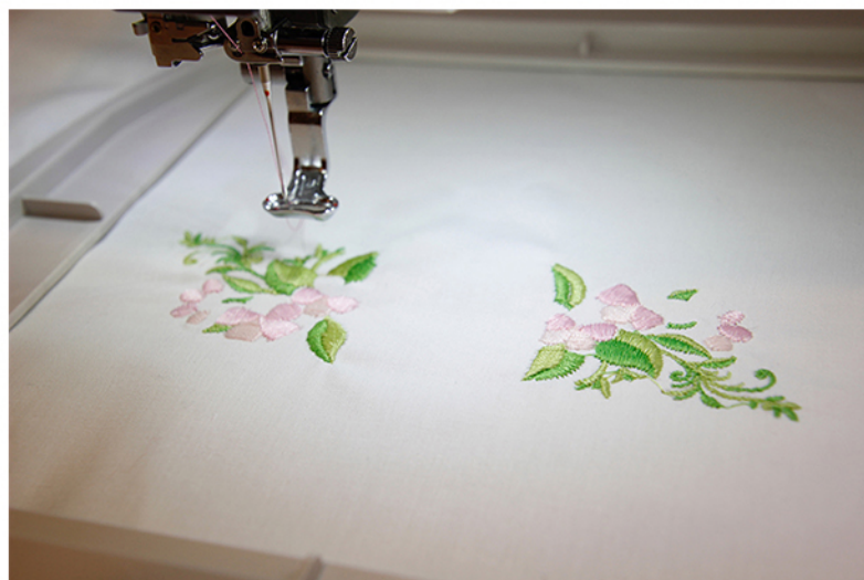
4. Then the next pink is slightly darker, and more flower petals will appear.