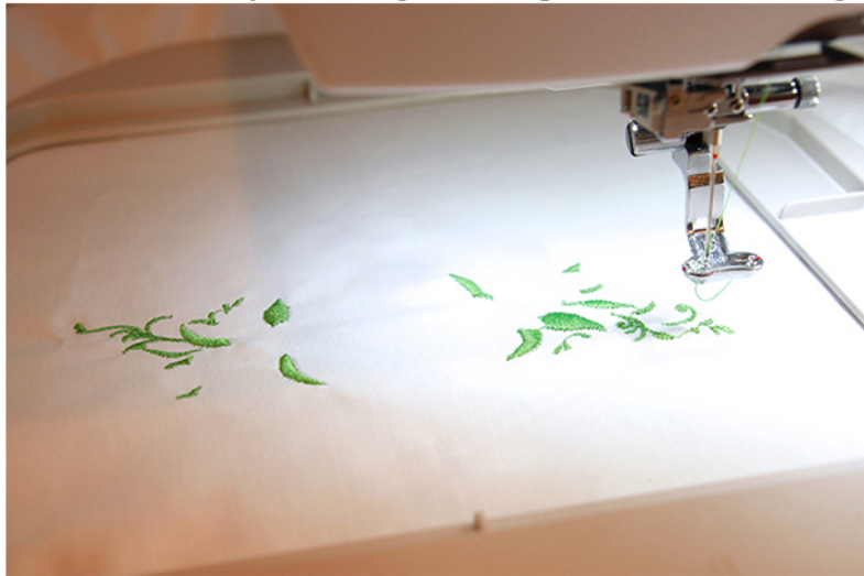
1. The Darker Spring green will be first up and will start the leaves..

Now I will walk you through the sequences of this design.