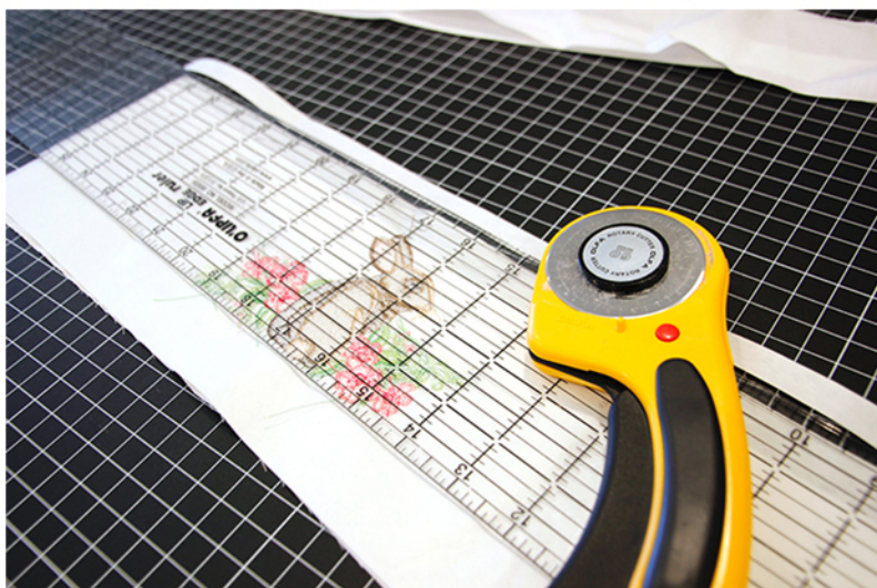
17. Trim 1/2 inch from the stabilizer from the top and the bottom of the strip without cutting the white fabric.