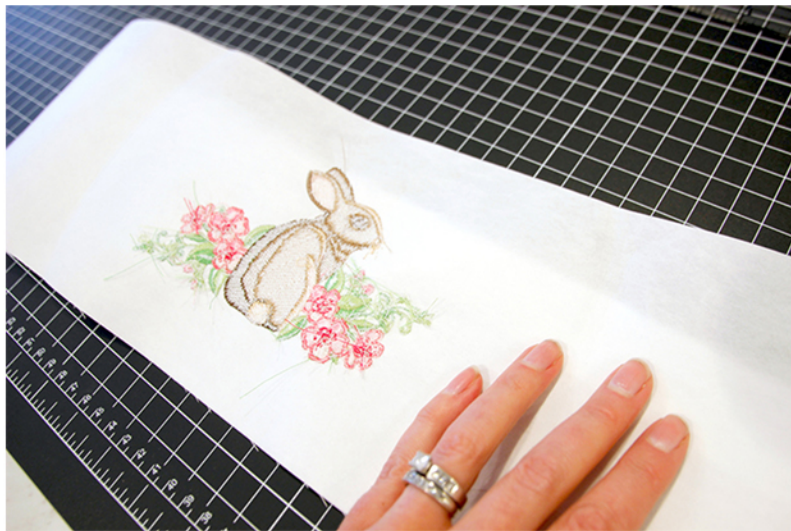
16. Now fold back the white fabric to allow you to trim the stabilizer only.