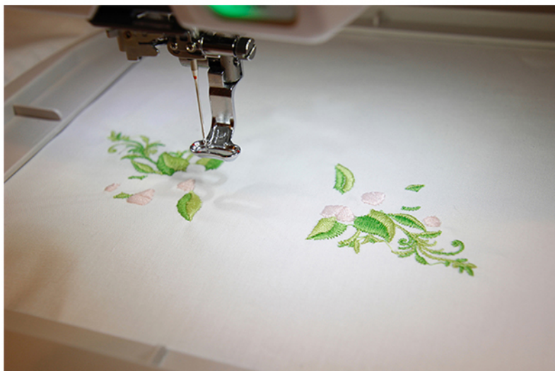
3. This sequence starts the pinks. Start with the lightest pink (barely blush.)