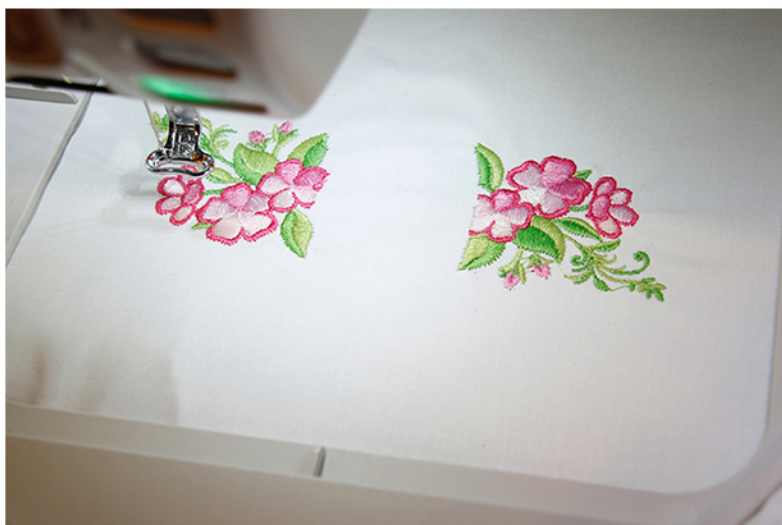
6. This sequence outlines the blossoms in a darker pink.