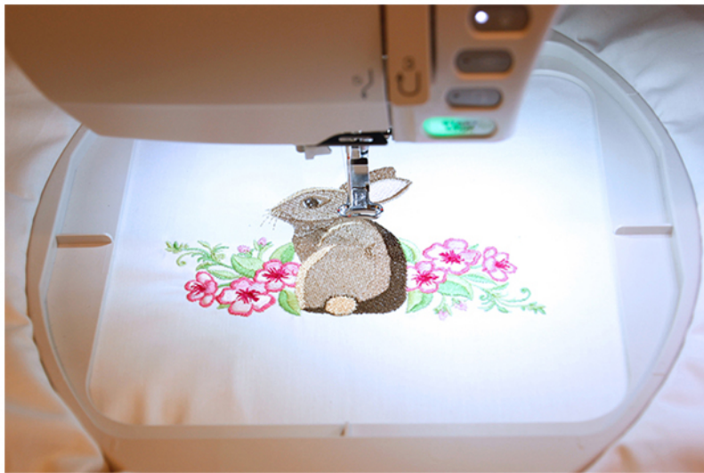
13. Lastly your lightest beige. Now you can unhoop and trim any jump threads.

Finishing the thread sequence...and getting it ready to attach to the towel.