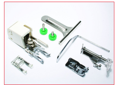
Quilting Kit Included