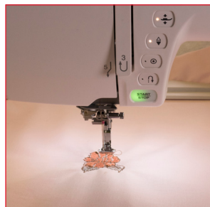
Maximum Embroidery Area: 9.1" x 11.8"