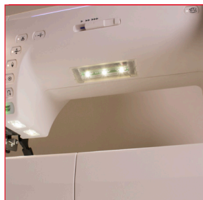
Full Intensity Lighting System