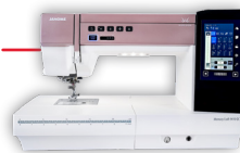
Horizon Memory Craft 9410QCP