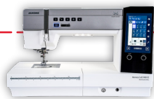
Horizon Memory Craft 9480QCP