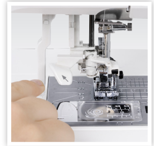
ONE-HANDED SUPERIOR NEEDLE THREADER 2