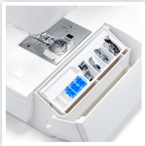
FREE ARM ACCESSORY STORAGE