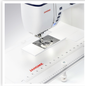
EXTRA-WIDE EXTENSION TABLE INCLUDED