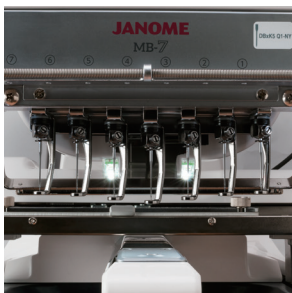
Includes 7 Needle Heads