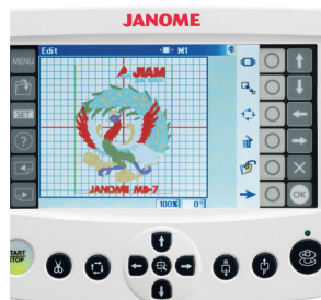
RCS (Remote Computer Screen)