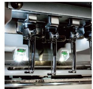
6 White LED Lights