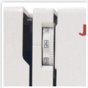
ADJUSTABLE THREAD TENSION