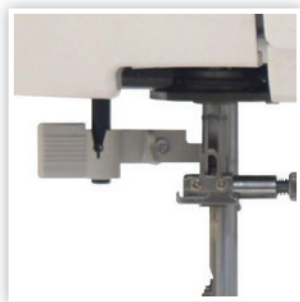
BUILT-IN ONE-HAND NEEDLE THREADER