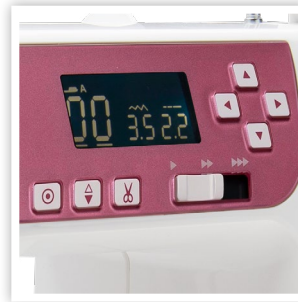
LCD SCREEN WITH HANDY FUNCTION KEYS