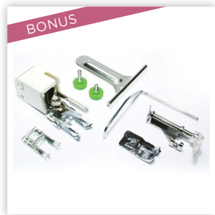
QUILTING KIT INCLUDED