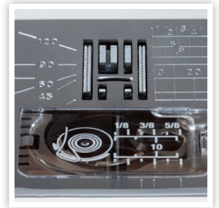
SUPERIOR PLUS FEED, 7-PIECE FEED DOG