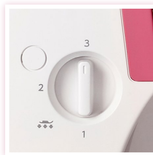
FOOT PRESSURE ADJUSTMENT DIAL FOR THIN, DELICATE AND MULTI-LAYERED FABRICS