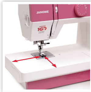
105.4 mm (LEFT) x 111.8 mm (IN FRONT) OF THE NEEDLE (4.15 x 4.4")