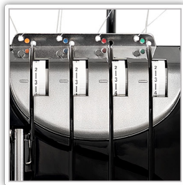
Lay-in Thread Tension Dials

Janome's HD4BE Serger (Black Edition), with its unique color, certainly makes a bold impression. With an electronic foot control, this is an advanced overlocker with 2 needles and 2, 3, or 4 thread overlock stitching. The differential feed ratio, which is adjustable from 0.5 to 2.25, provides exceptional control for handling all types of fabrics and for creating desired special effects. Color-coded thread guides help with machine threading. The guide is automatically returned to its normal position when you turn the balance wheel. The thread tension automatically releases when you lift the presser foot so you can draw through the threads smoothly. The HD4BE also lets you quickly switch to rolled hemming without changing the needle plate. A lower looper pre-tension stitch eliminates the need to change tension for rolled hems.