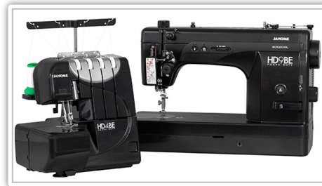
Perfect companion for HD9BE Professional Machine