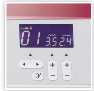
EASY STITCH SELECTION AND ADJUSTMENTS