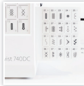
QUICK REFERENCE STITCH CHARTS