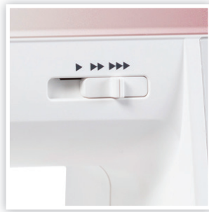
STITCH SPEED CONTROL