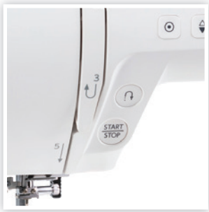
CONVENIENT START/STOP BUTTON