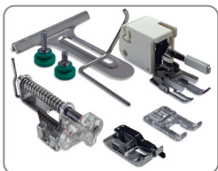
BONUS INCLUDED: Quilting Kit