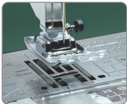
7-Piece Feed Dog