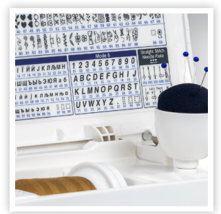
196 STITCHES, UP TO 9MM WIDE