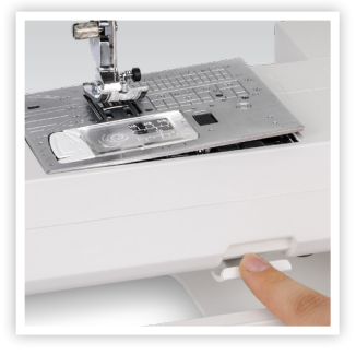
ONE-STEP NEEDLE PLATE