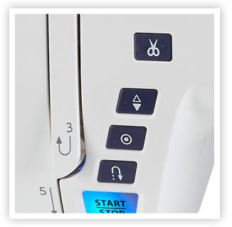
AUTOMATIC THREAD CUTTER