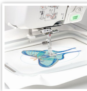
EMBROIDERY SEWING SPEED: 60 - 800 SPM