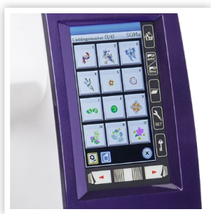
LCD FULL COLOR TOUCHSCREEN