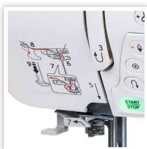
SUPERIOR NEEDLE THREAD THREAD GUIDE 7