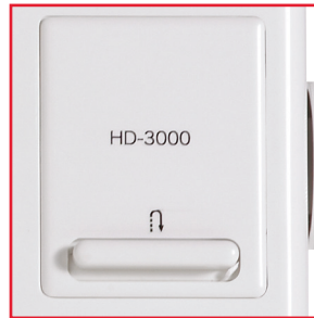
Reverse Stitch Lever