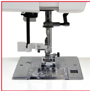
Built-in Needle Threader