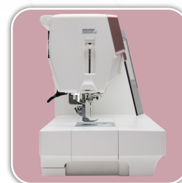
Improved Ergonomic Design