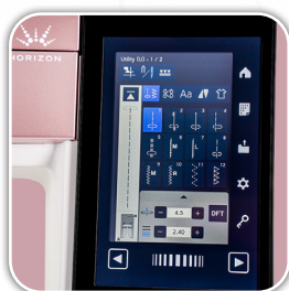
High-Def 5" LCD Color Touchscreen