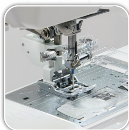
Detachable AcuFeed™ Flex Layered Feeding System