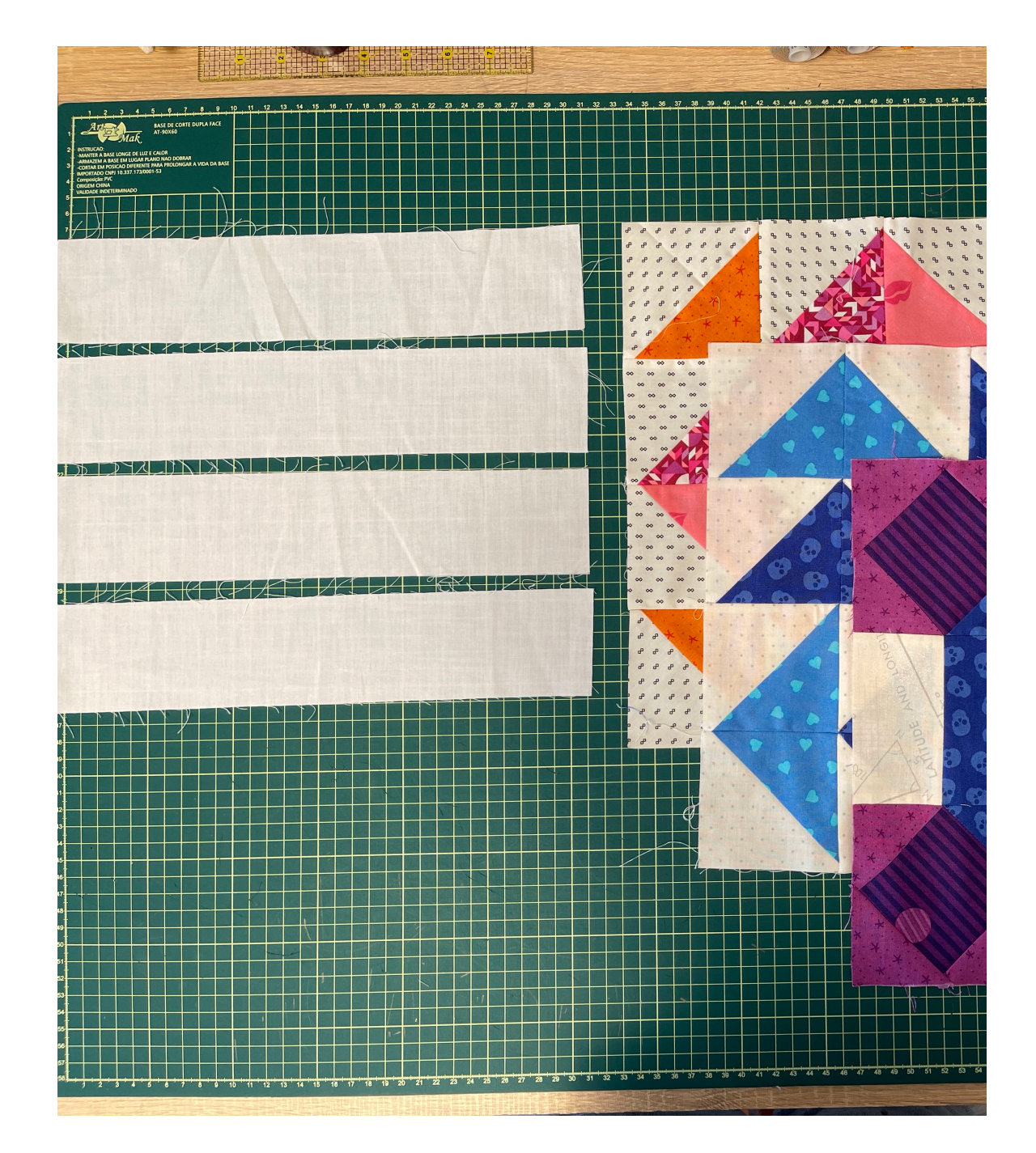
You can follow the original picture design to organize your colors and blocks

To construct the four block rows you have to sew four color rectangles with three blocks alternated, so you will start and finish the row with a rectangle.